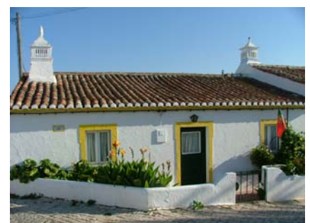
An Algarvian Fisherman's Cottage