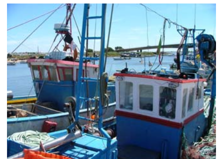
Taviran Fishing Boats