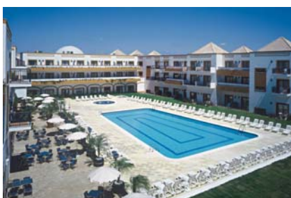
The Outdoor Pool