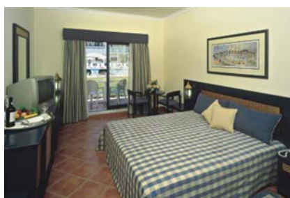
A Standard Pool View Room