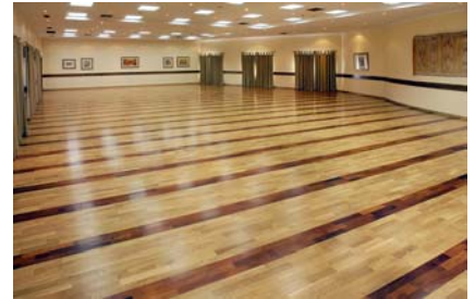
The Vila Galé Tavira Ballroom